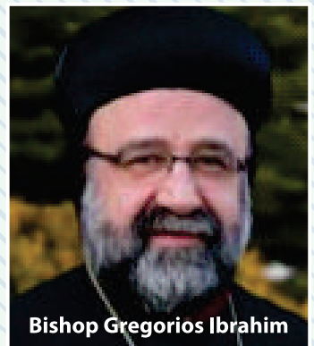
Bishop Gregorios Ibrahim